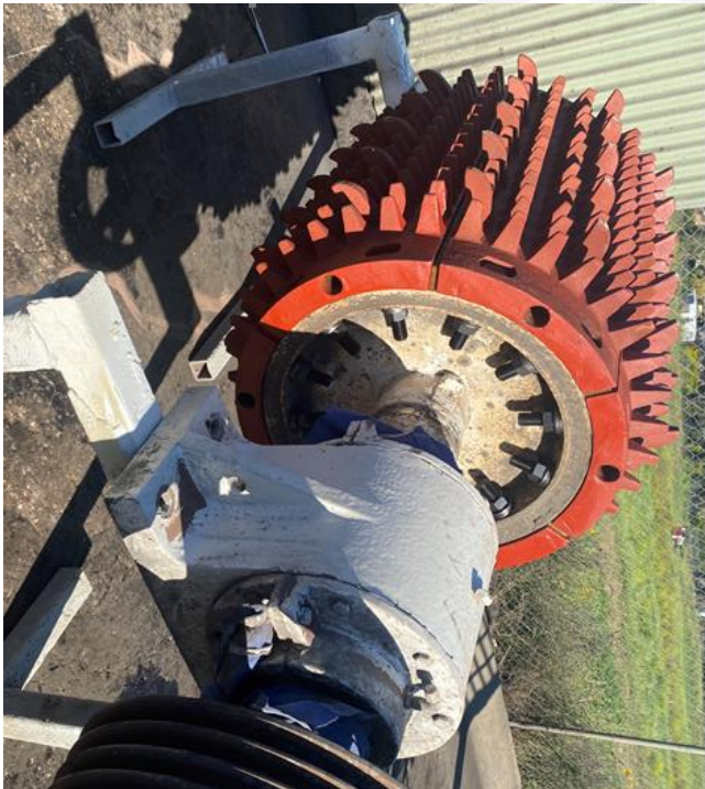
Repairs to Crusher Drums