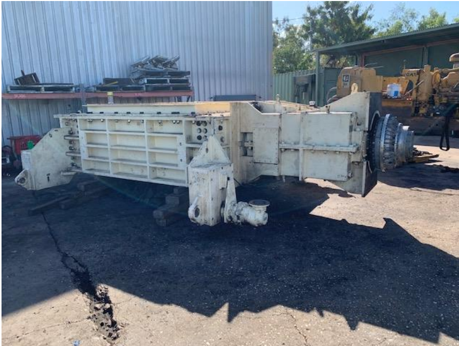
Overhaul of 22T Crusher

H·E·M·E PTY LTD PROFESSIONALS IN PRECISION