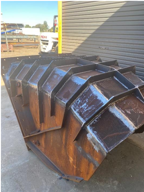
Fabricate Intermediate Chute