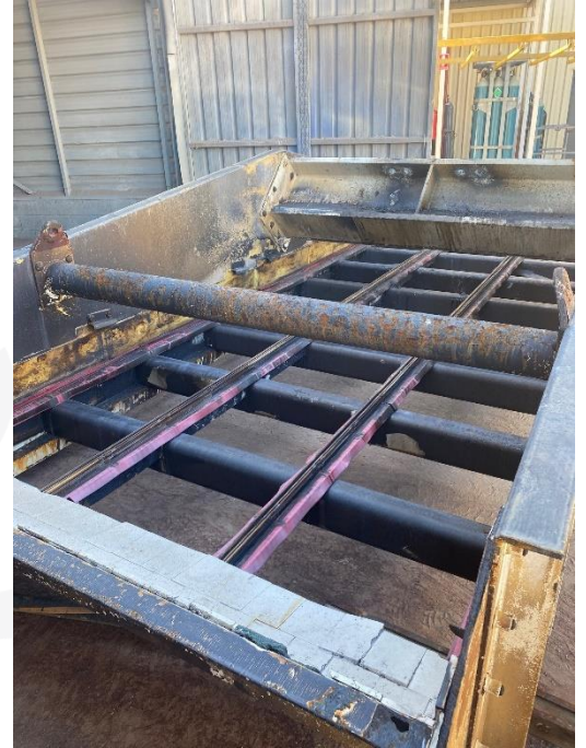
Repairs to Screen deck