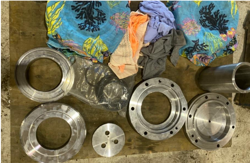
Machining parts for Bogie assemblies