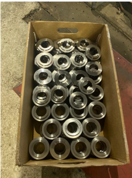
CNC Machining Roller Spacers