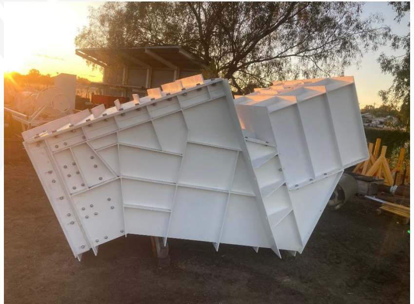
Fabricate, Sandblast & Paint Head Transition Feed Chute