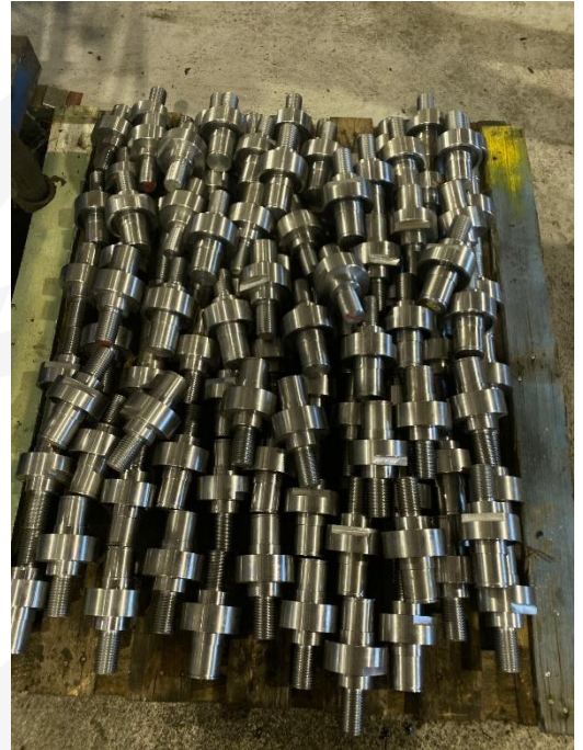
CNC Machining/ Assembling Chain Rollers