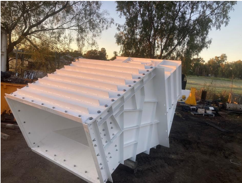
Fabricate, Sandblast & Paint Head Feed Chute