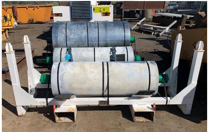
Overhaul of Pulley's

☎ 07 4982 3001 ✉ admin@heme.com.au 🌐 www.heme.com.au 🏠 20 Hawkins Place, Emerald, Qld, 4720 | PO Box 1907, Emerald, Qld, 4720