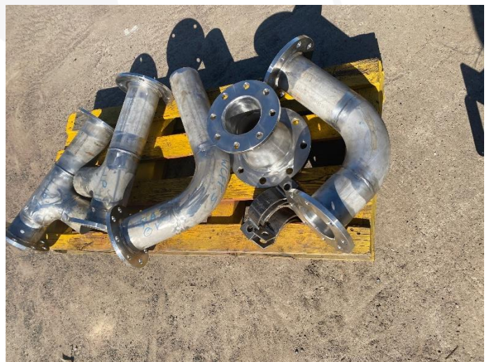
Welding Pipes and Flanges