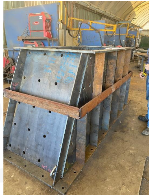
Fabricate Discharge Chute